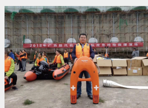
Mobile Rescue Team