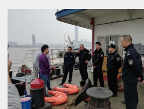
Ports & Harbour Authority